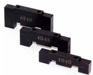
Clamping keys for different pipe diameters